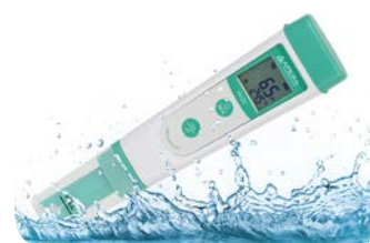
IP67 waterproof and dustproof