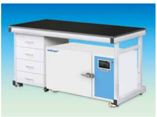
Fig1 ; Under-bench Installation