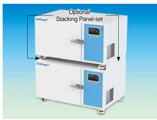
Fig2 ; 2 unit Stacked with Optional Stacking Panel-set