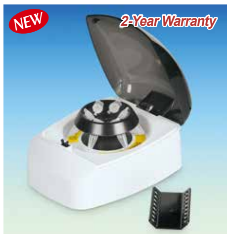
Mini-microcentrifuge Set “MaXpin C-6mt” with Circular Fixed Angle Rotor

DAIHAN-brand® New-generation Mini-microcentrifuge Set, “MaXpin C-6mt”, Max. 5,500 rpm, Rapidly Stop Spin-motion for safety with Circular Fixed-Angle Rotor for 6×0.2/0.5/1.5/2.0ml Tubes and Strip Rotor for 2×0.2ml PCR 8-tubes Strips/16×0.2ml PCR Tubes 미니-마이크로 원심분리기 세트, 신속한 회전동작 정지, 앵글-/스트립-로터 포함, 0.2/0.5ml 튜브 아답터 포함 NEW