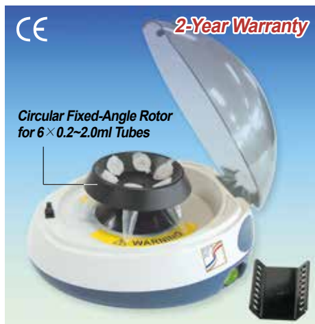
Mini-microcentrifuge Set “CF-5” with Circular Fixed Angle Rotor

DAIHAN-brand® High performance Mini-microcentrifuge Set, “CF-5”, Max. 5,500 rpm, with Certi. & Traceability with Circular Fixed-Angle Rotor for 6×0.2/0.5/1.5/2.0ml Tubes and Strip Rotor for 2×0.2ml PCR 8-tubes Strips/16×0.2ml PCR Tubes 미니-마이크로 원심분리기 세트, 앵글-/스트립-로터 포함, 0.2/0.5ml 튜브 아답터 포함