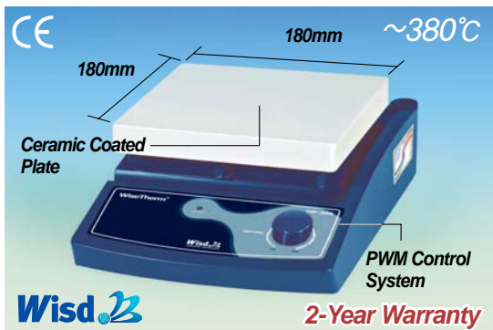
180×180mm Plate-type Hotplate "HP-20A"