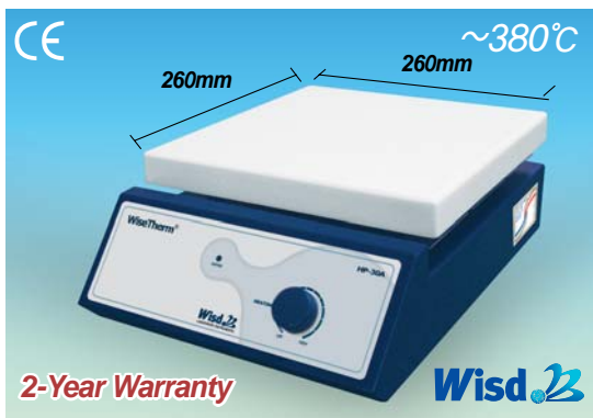
260×260mm Plate-type Hotplate "HP-30A"

* Other Specifications are available upon Customer's Request.