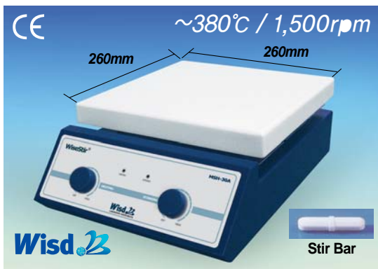
260×260mm Plate-type Hotplate Stirrer “MSH-30A”