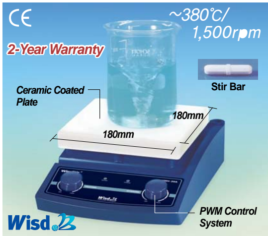
180×180mm Plate-type Hotplate Stirrer “MSH-20A”